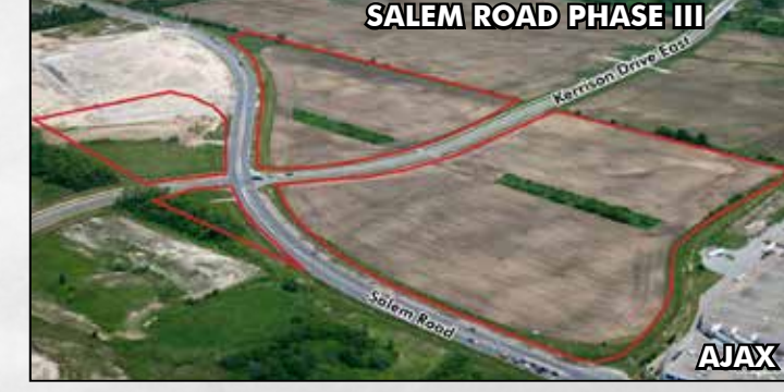
SALEM ROAD PHASE III

+/- 12.72 Acres SOLD $6,800,000 LAND USE: PRESTIGE EMPLOYMENT