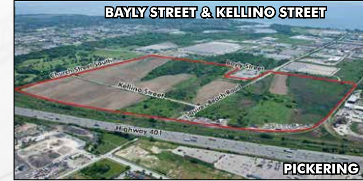
BAYLY STREET & KELLINO STREET

+/- 5.97 Acres SOLD $15,500,000 LAND USE: HIGH RISE RESIDENTIAL