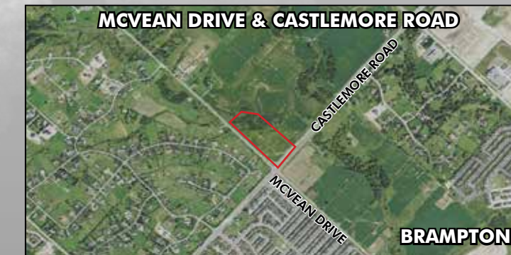
MCVEAN DRIVE & CASTLEMORE ROAD

+/- 0.23 Acres SOLD $4,888,888 LAND USE: MIXED USE