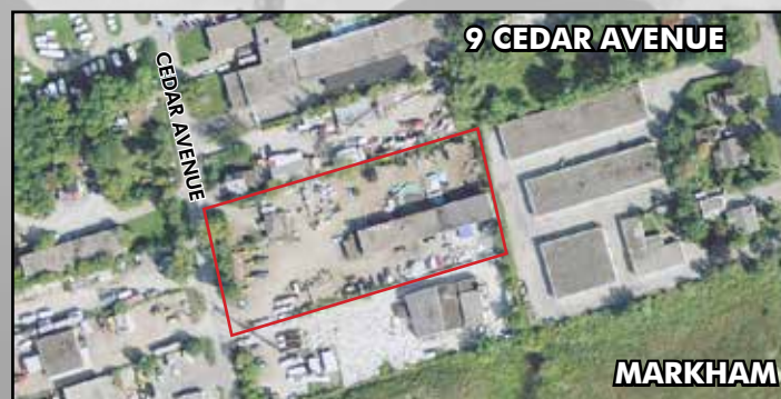
9 CEDAR AVENUE

+/- 4.05 Acres SOLD $1,200,000 LAND USE: GENERAL AND MIXED EMPLOYMENT