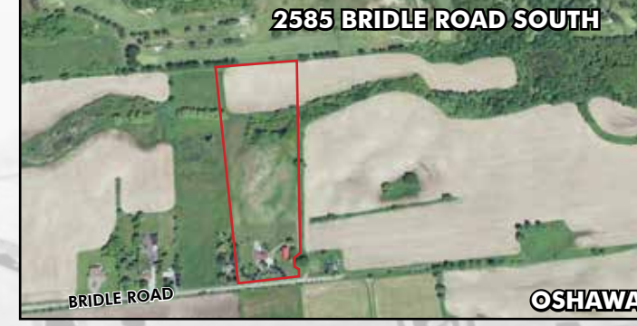
2585 BRIDLE ROAD SOUTH

+/- 2.41 Acres SOLD $819,400 LAND USE: PRESTIGE EMPLOYMENT