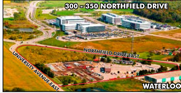
300 - 350 NORTHFIELD DRIVE

+/- 222.3 Acres SOLD $8,800,000 LAND USE: INDUSTRIAL