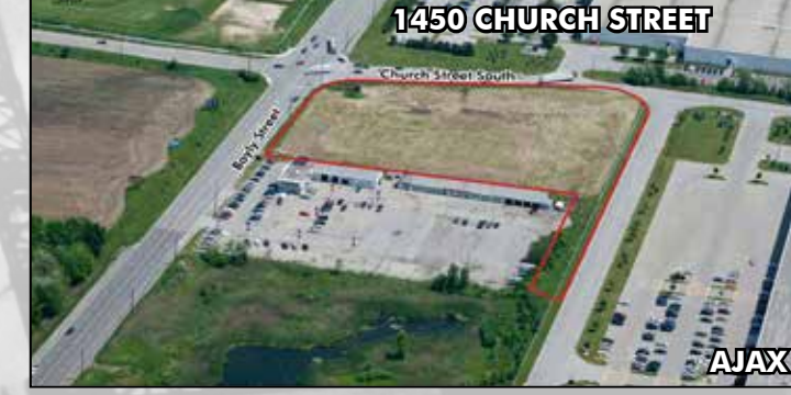
1450 CHURCH STREET

+/- 12.30 Acres SOLD $1,300,000 LAND USE: FUTURE DEVELOPMENT