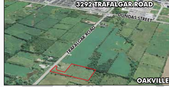
3292 TRAFALGAR ROAD

+/- 17.09 Acres SOLD $7,100,000 LAND USE: EMPLOYMENT