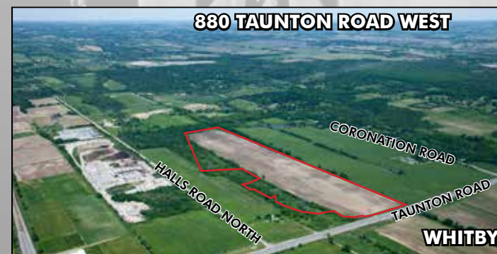
880 TAUNTON ROAD WEST

+/- 2.00 Acres SOLD $4,775,000 LAND USE: MIXED USE