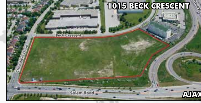
1015 BECK CRESCENT

+/- 10.93 Acres SOLD $5,333,600 LAND USE: MIXED USE