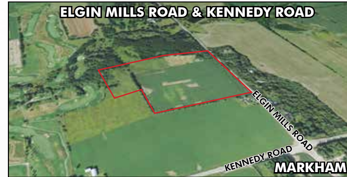
ELGIN MILLS ROAD & KENNEDY ROAD

+/- 2.07 Acres SOLD $65,000,000 LAND USE: HIGH RISE RESIDENTIAL