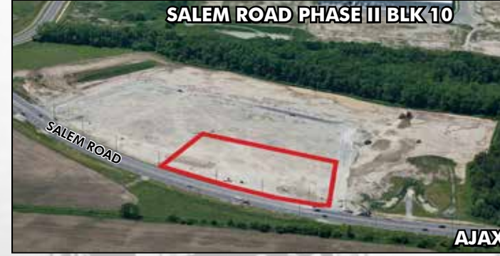
SALEM ROAD PHASE II BLK 10

+/- 23.79 Acres SOLD $1,900,000 LAND USE: FUTURE RESIDENTIAL