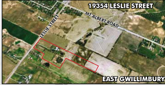
19354 LESLIE STREET

+/- 52.51 Acres SOLD $6,600,000 LAND USE: PRESTIGE & GENERAL EMPLOYMENT