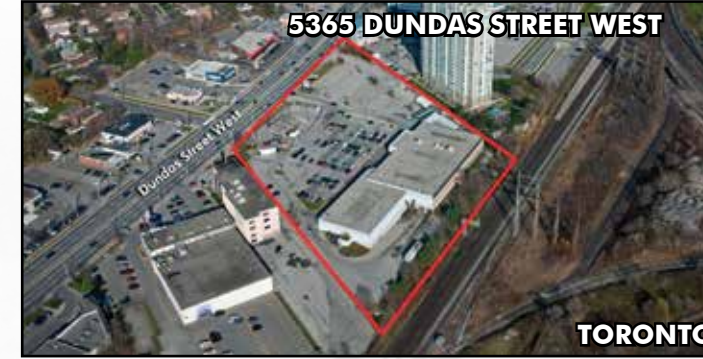
5365 DUNDAS STREET WEST

+/- 50.0 Acres SOLD $11,350,000 LAND USE: FUTURE NEIGHBOURHOOD AREA